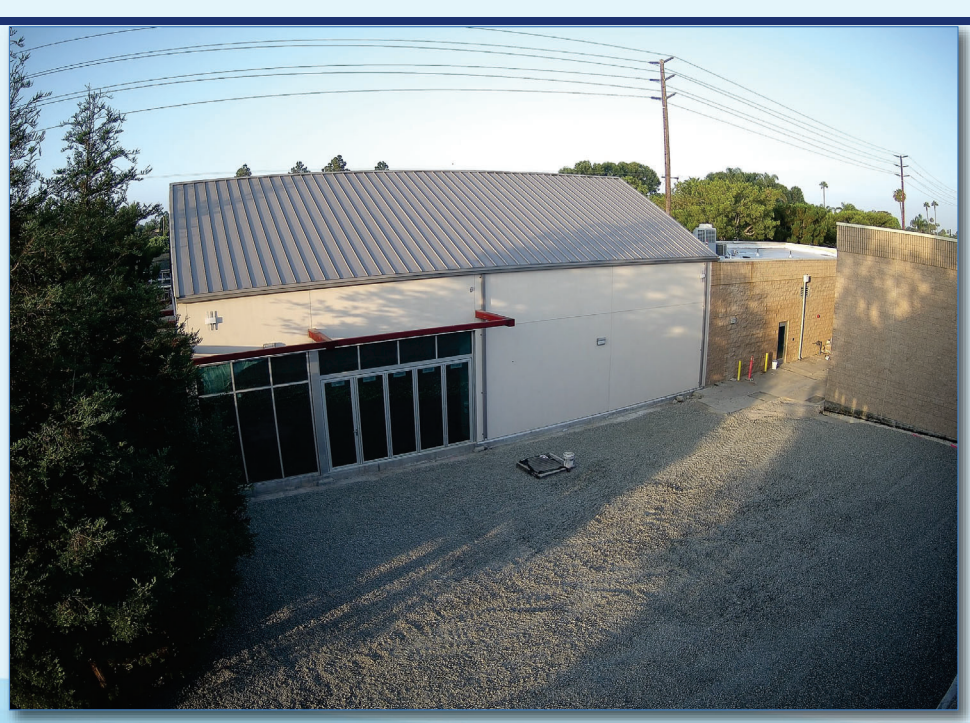
SCADA Control Room and Wet Lab Upgrade Project July 2023