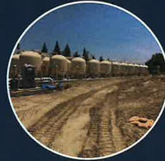
Yorba Linda Water District Largest in nation December 2021