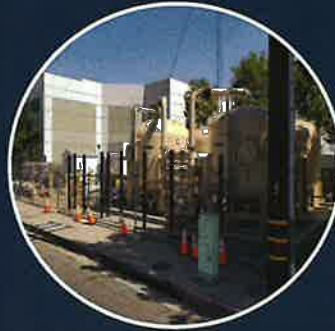
City of Fullerton First operating plant June 2021