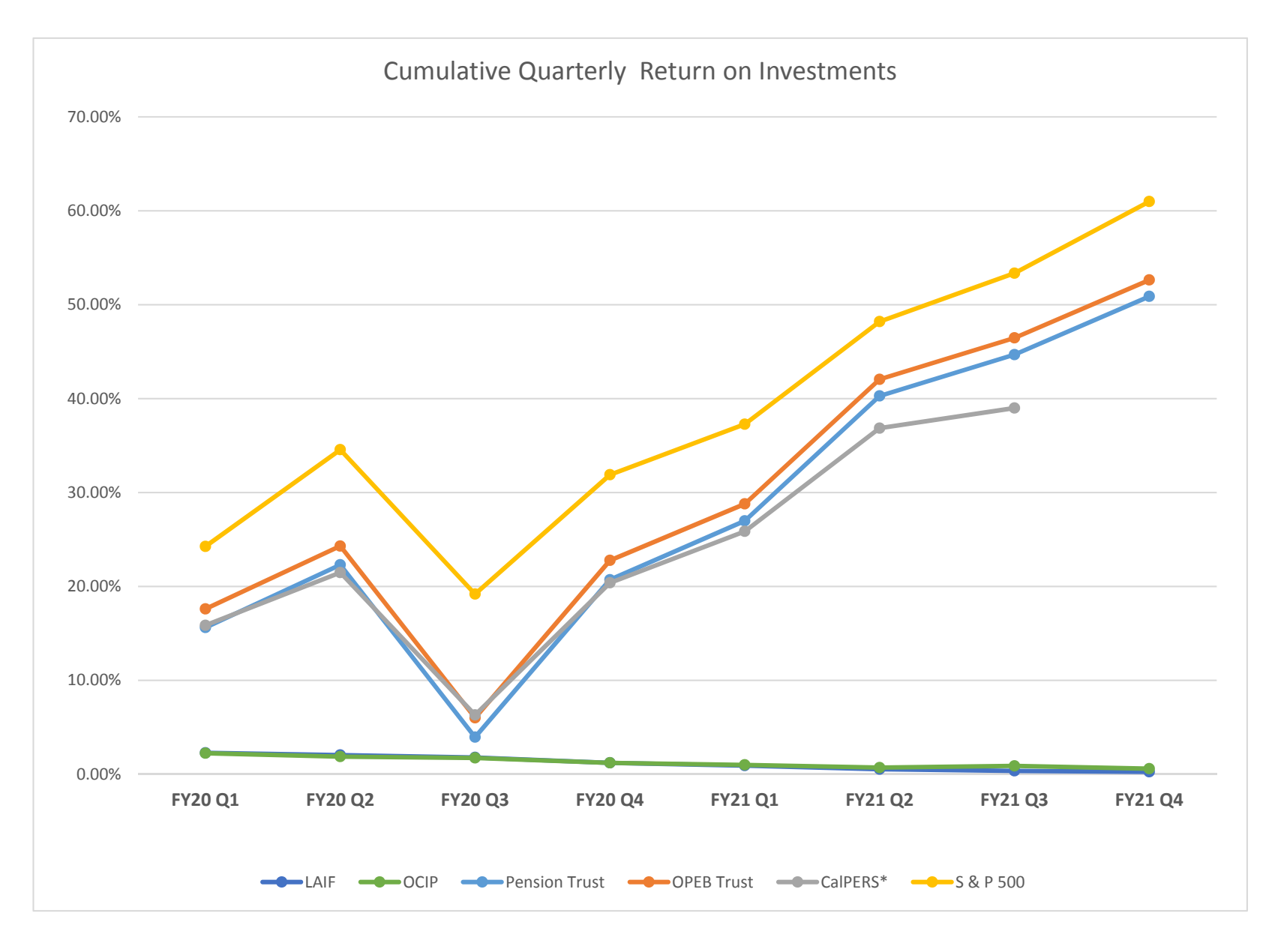
* CalPERS FY21 Q4 data was unavailable at time of publishing.