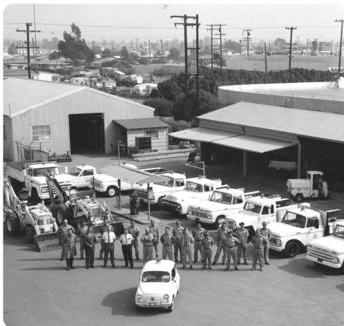
Mesa Water field personnel, circa 1965.