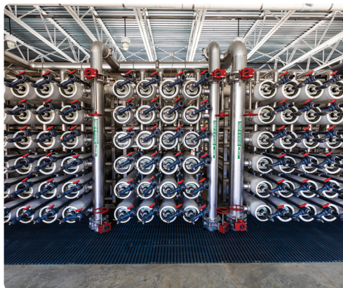
MWRF, Present Day

The Mesa Water Reliability Facility (MWRF) is yet another step in providing clean, safe and reliable water.