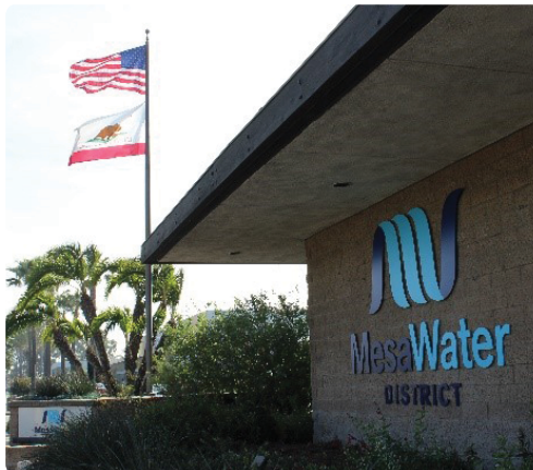
Mesa Water Office, Placentia Avenue, Present Day

With the exception of both state and U.S. flags flying high, our main office today is almost unrecognizable from 60 years ago.