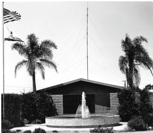
Costa Mesa County District Offices, Placentia Avenue, 1960

In 2013, we simplified our name to Mesa Water District (Mesa Water®). The current logo conveys the evolution of our District, and its branding.