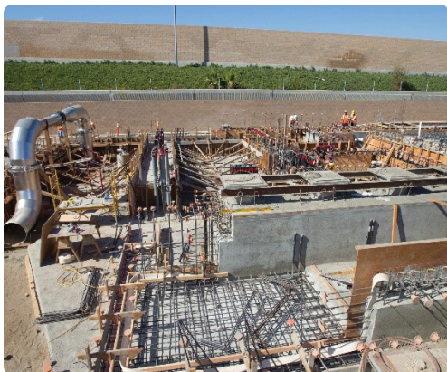
Construction of the MWRF, 2001

Mesa Water has been, and continues to be, dedicated to providing you with safe and reliable water. Take a look at how we've grown to ensure we meet our community's water needs.