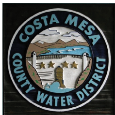
Costa Mesa County Water District 1960 - 1978

The Mesa Water Reliability Facility (MWRF) is yet another step in providing clean, safe and reliable water.