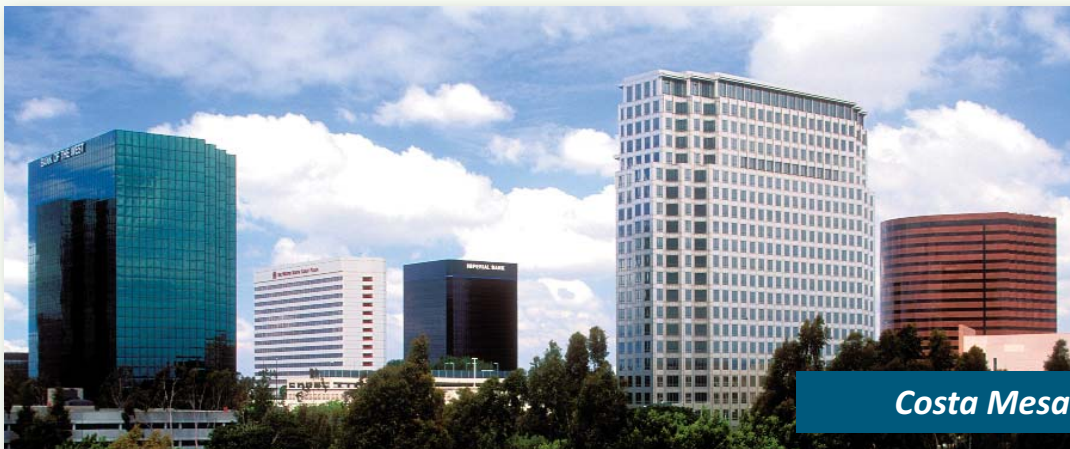
Costa Mesa Skyline

These and other topics may be tailored to your organization or event.