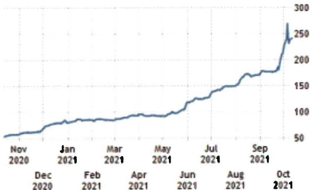
Coal Price Surge, 27 September 2021.

The United States was a net energy exporter in both 2019 and 2020, so despite rising gas prices, we are better positioned than most countries to deal with the energy shock. In India, which is heavily coal reliant, 63 of 138 of its power plants have less than two days supply of coal. India relies on coal for 70% of its power.