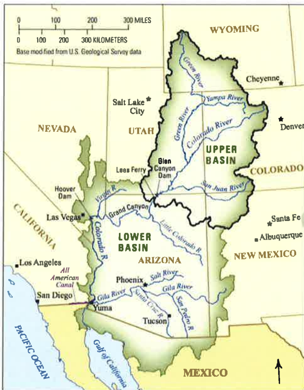
Colorado River Basin map

Finally - Some relief for Four Corners area and the Colorado River